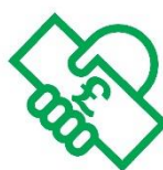
Table 1 shows the full-time equivalent annual or hourly pay rate of selected job roles in Kingston upon Hull (area), Yorkshire and the Humber (region) and England. All figures represent the independent sector as at March 2024, except social workers which represent the local authority sector as at September 2023. At the time of analysis, the National Living Wage was £10.42.