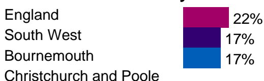
Chart 1. Proportion of workers on zero hours contracts by area

Less than a quarter (17%) of the workforce were on zero-hours contracts.