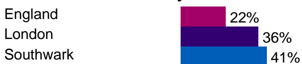
Chart 1. Proportion of workers on zero hours contracts by area

Under half (41%) of the workforce were on zero-hours contracts.