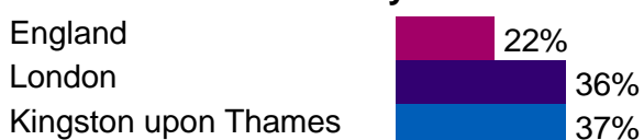
Chart 1. Proportion of workers on zero hours contracts by area

Under half (37%) of the workforce were on zero-hours contracts.