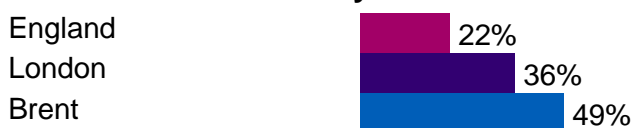
Chart 1. Proportion of workers on zero hours contracts by area

Around half (49%) of the workforce were on zero-hours contracts.