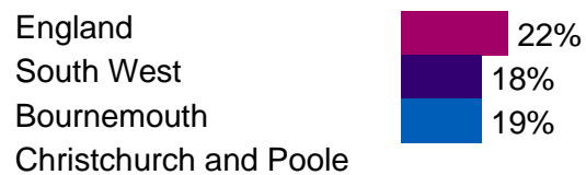
Chart 1. Proportion of workers on zero hours contracts by area

Less than a quarter (19%) of the workforce in Bournemouth Christchurch and Poole were on zero-hours contracts. Around two thirds (60%) of the workforce usually worked full-time hours and 40% were part-time.