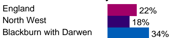
Chart 1. Proportion of workers on zero hours contracts by area

Around a third (34%) of the workforce in Blackburn with Darwen were on zero-hours contracts. Around half (53%) of the workforce usually worked full-time hours and 47% were part-time.